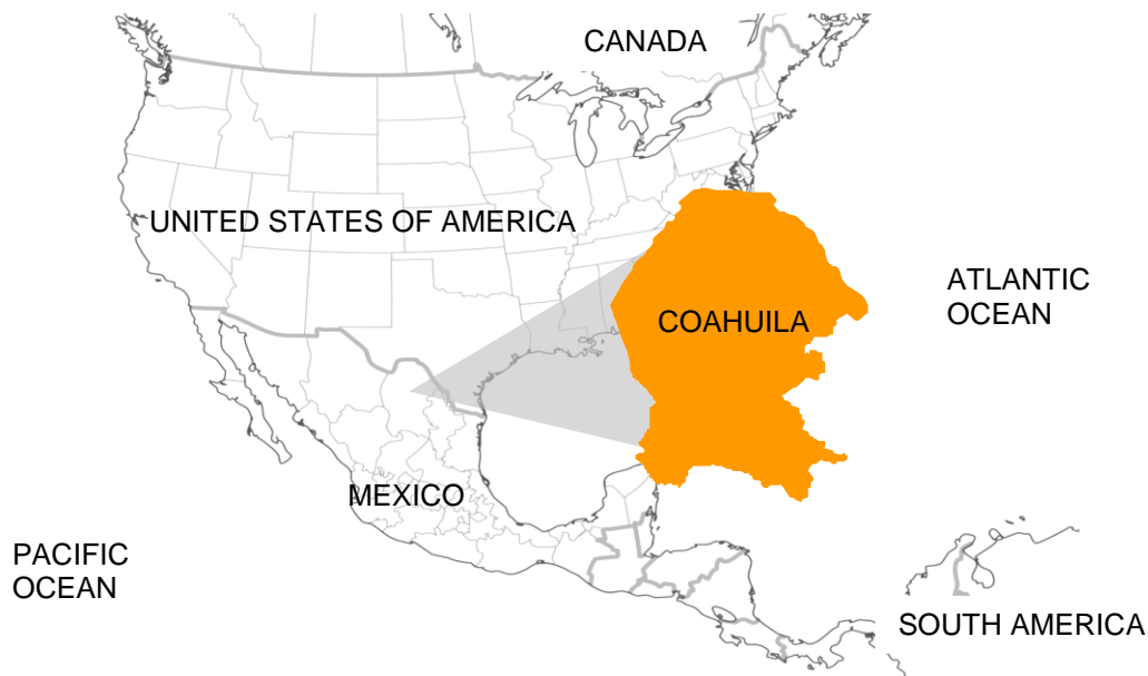
Map 1. Location of Coahuila de Zaragoza in North America

Coahuila de Zaragoza is the third largest state in the country, located in northeastern Mexico and shares a 512-kilometer border with the U.S. state of Texas. In Mexico it borders the states of Chihuahua, Durango, Zacatecas, San Luis Potosí and Nuevo Leon.